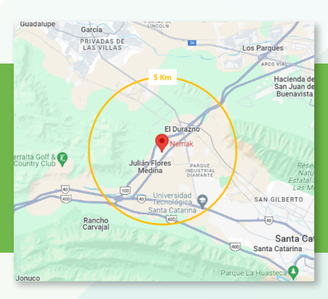
Figure 1: Area of Social Influence – Nemak Mexico García

The area of social influence for Nemak Mexico (García site) is defined as the area within 5 Km radius from the site: